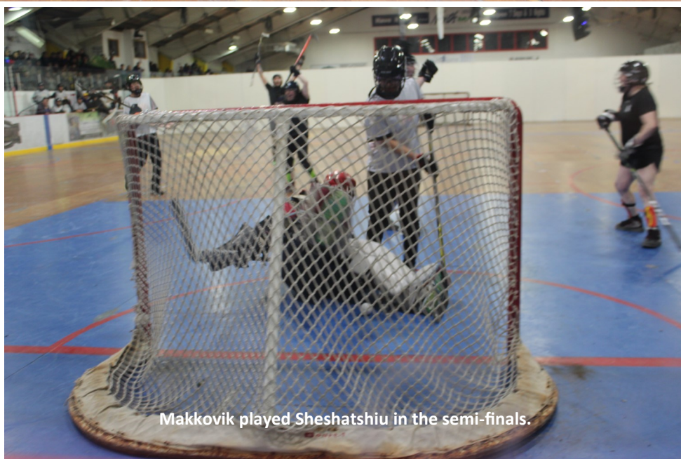
Makkovik played Sheshatshiu in the semi-finals.