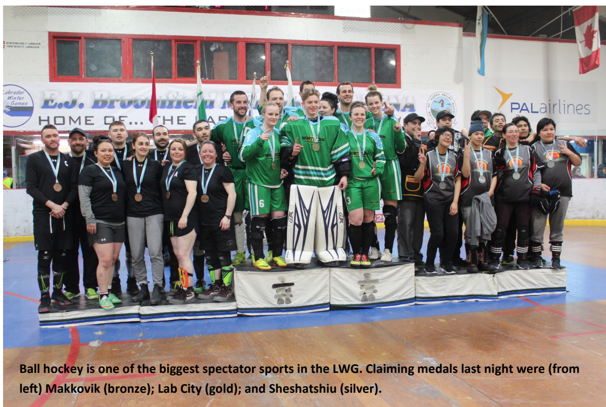
Ball hockey is one of the biggest spectator sports in the LWG. Claiming medals last night were (from left) Makkovik (bronze); Lab City (gold); and Sheshatshiu (silver).

After that, the goals just kept coming until they were up 7-0 and the mercy rule was put into effect.