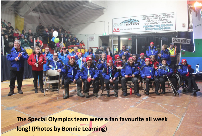
The Special Olympics team were a fan favourite all week long!