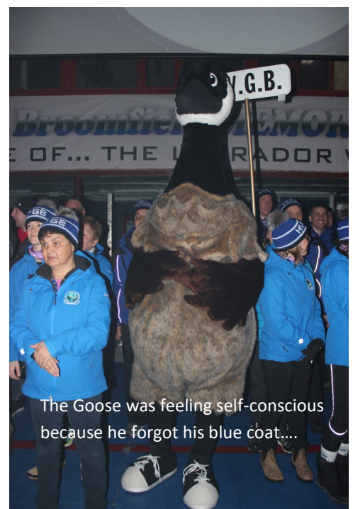
The Goose was feeling self-conscious because he forgot his blue coat....