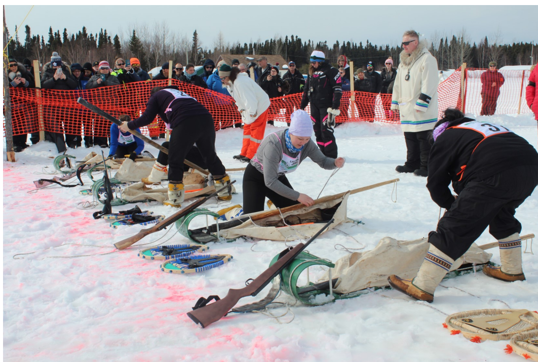
The women get their sleds lashed down before setting out for the fire tilt in heat 2 yesterday.