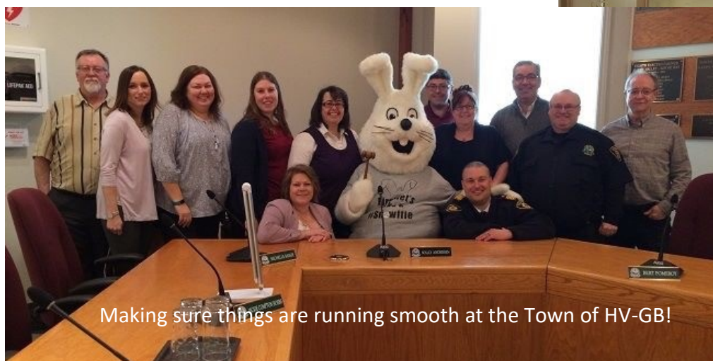
Making sure things are running smooth at the Town of HV-GB!