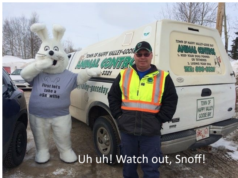
Uh uh! Watch out, Snoff!