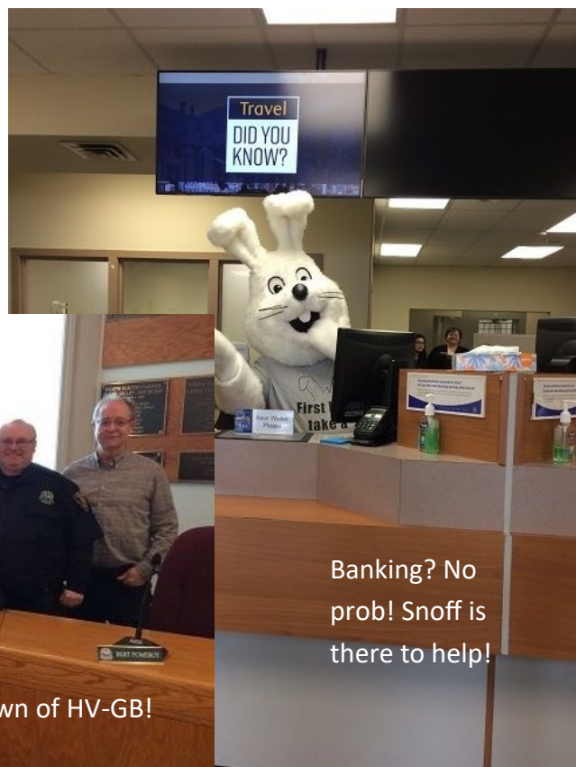
Banking? No prob! Snoff is there to help!