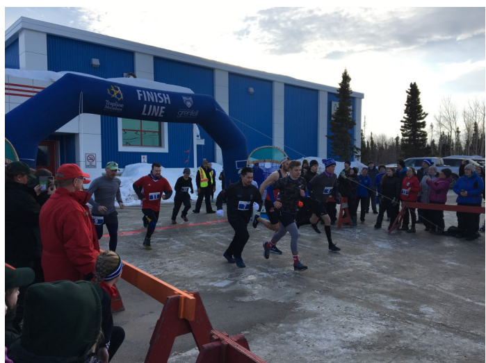
The men take off from the start line at the inaugural Lab Run