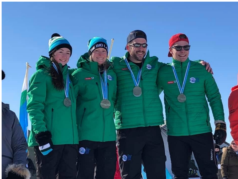
Team Labrador City claimed the gold medal—and a new Games record in the process! - in the snowshoe relay on Tuesday morning.