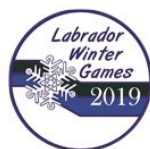
Table Tennis Overall Points