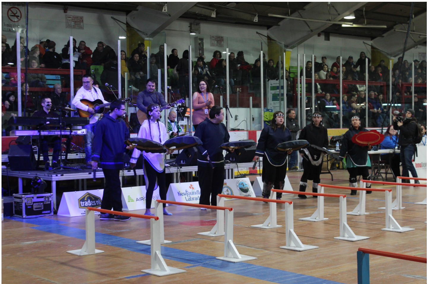
Prior to the start of the Northern Games last night, the crowd was entertained with music & drum dancing.