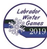
Table Tennis Female