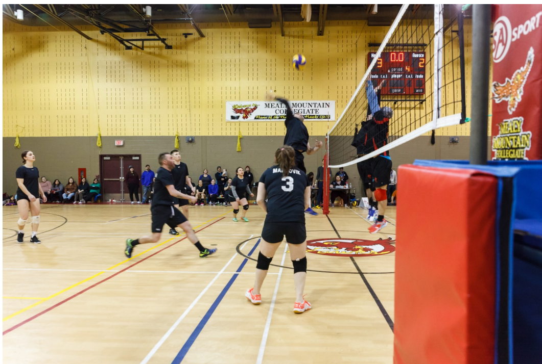
Team Makkovik claimed the gold medal in yesterday's volleyball showdown for their 5th consecutive LWG title .

From the very start of the day, volleyball reigned supreme. A very narrow victory between HV-GB and Hopedale during one of the first matches in the morning led to a 30-28 victory for HV-GB, the game was intense, and as the day went on, games kept gaining more momentum!