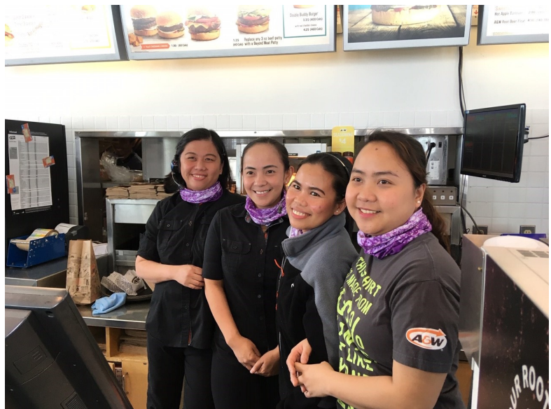
The fine ladies at A & W in Goose Bay are certainly worthy of VPL buffs as they spread #BigLandKindness every day!