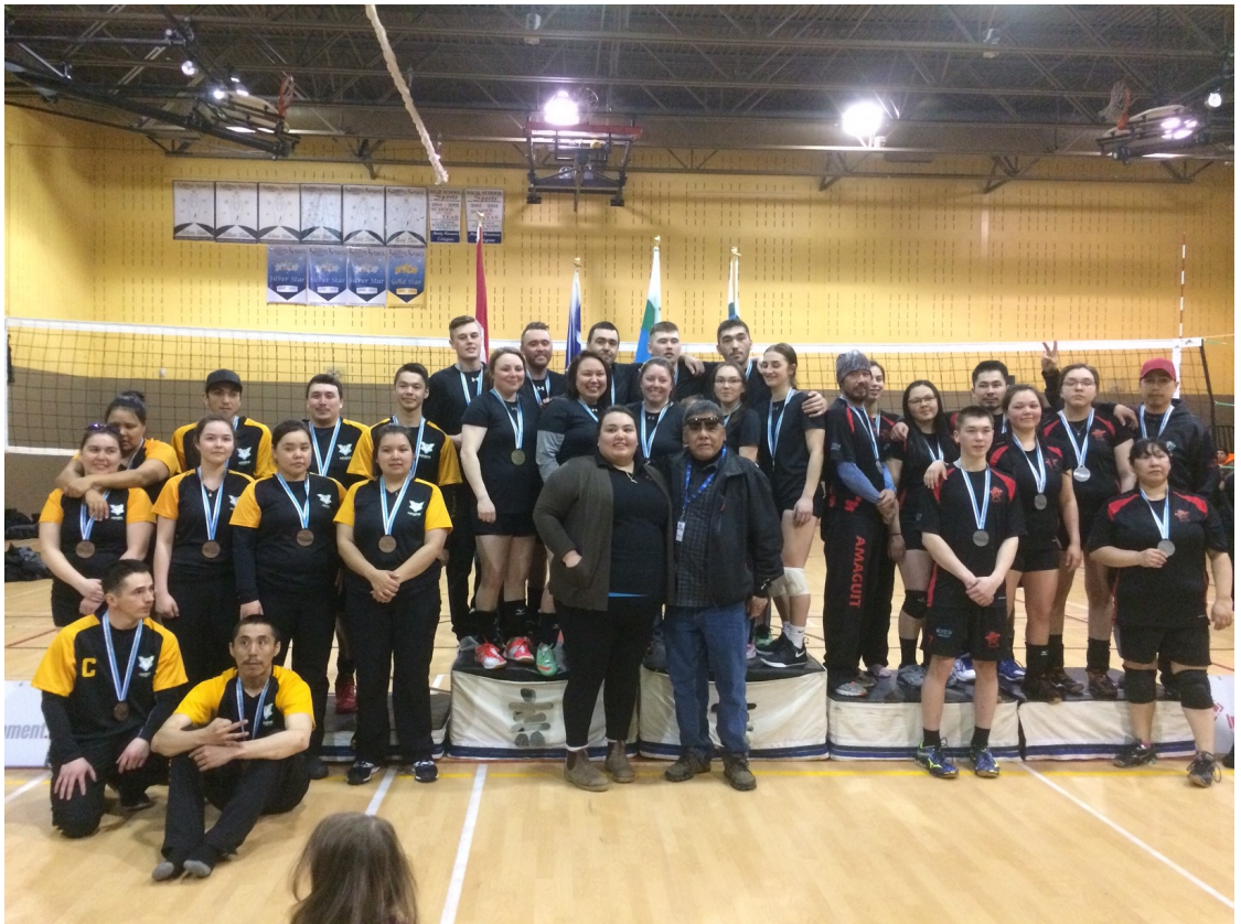
The north coast completely and utterly dominated the volleyball finals!

The final once again brought together Makkovik against Nain. Who would claim the North Coast victory? The finals had everyone on their feet, with Makkovik taking the first game 25-15 in a hard hitting game against the best of the coast.