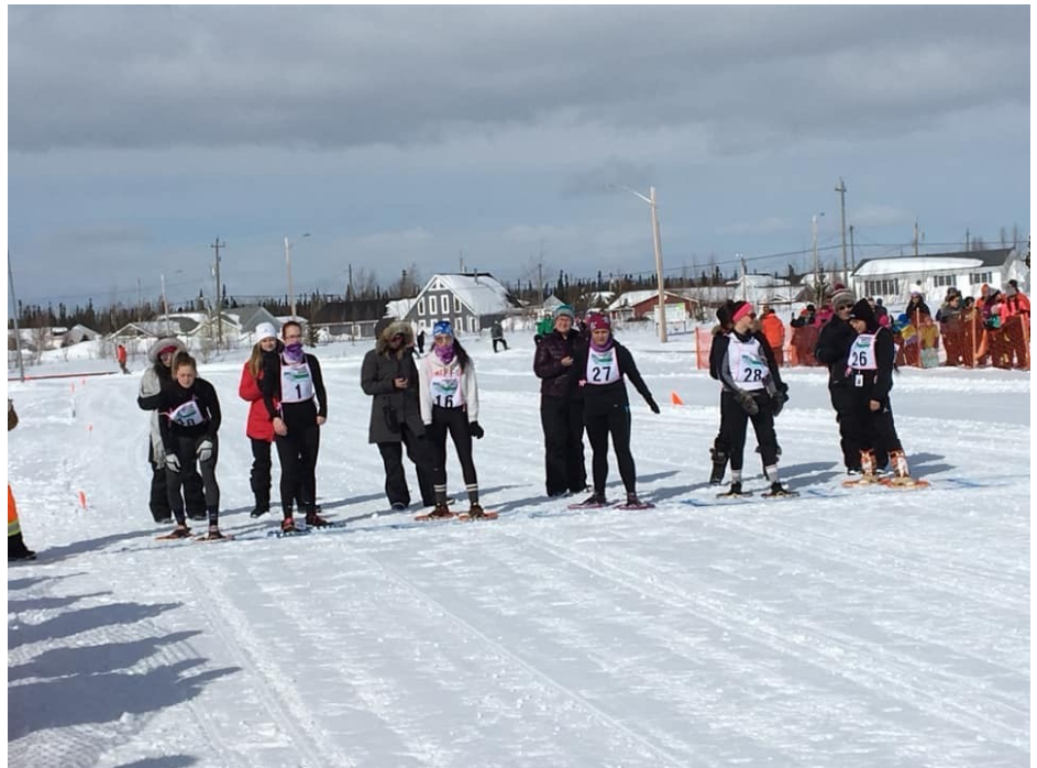
It was an exciting day for at the snowshoe track yesterday, with both the women's and men's races providing some great sport on a beautiful day!

Another exciting day of competition awaits us today! The women's finals start at 10:30 a.m. with men's finals starting at 10:45 a.m. The Special Olympians will be racing at 11:30 am with seven heats of athletes competing. The final event of the day is the relay that starts at 12:15 p.m. with 16 communities racing in three heats. Medal presentations will follow for all snowshoe events.