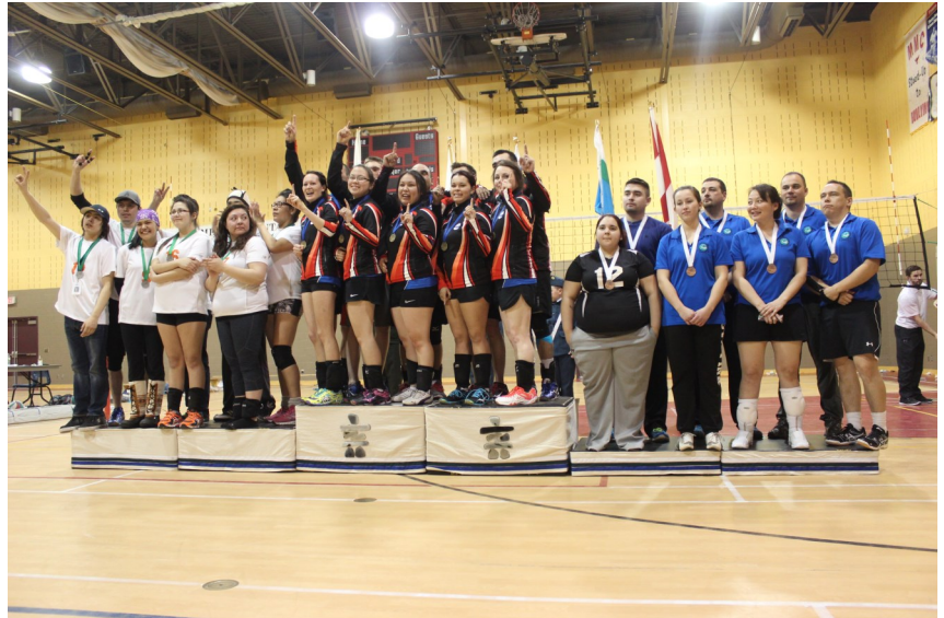
It was a great day of volleyball at MMC, as teams battled it out for medals. In the end, it was Sheshatshiu (left) that claimed silver; Makkovik (centre), gold; and HV-GB (right) bronze.