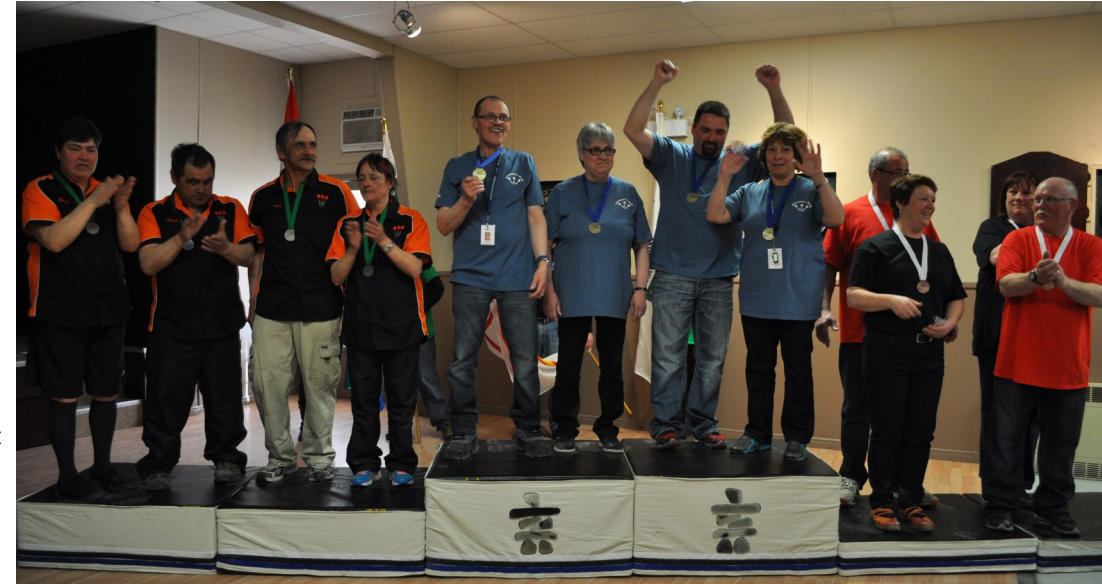
Darts winners were (from left) team Cartwright in silver place; Pinsent's Arm, gold; and Forteau, bronze.