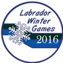
Table Tennis Mixed Doubles