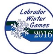
Table Tennis Male