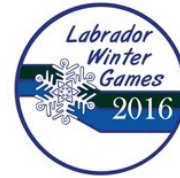
Table Tennis Female