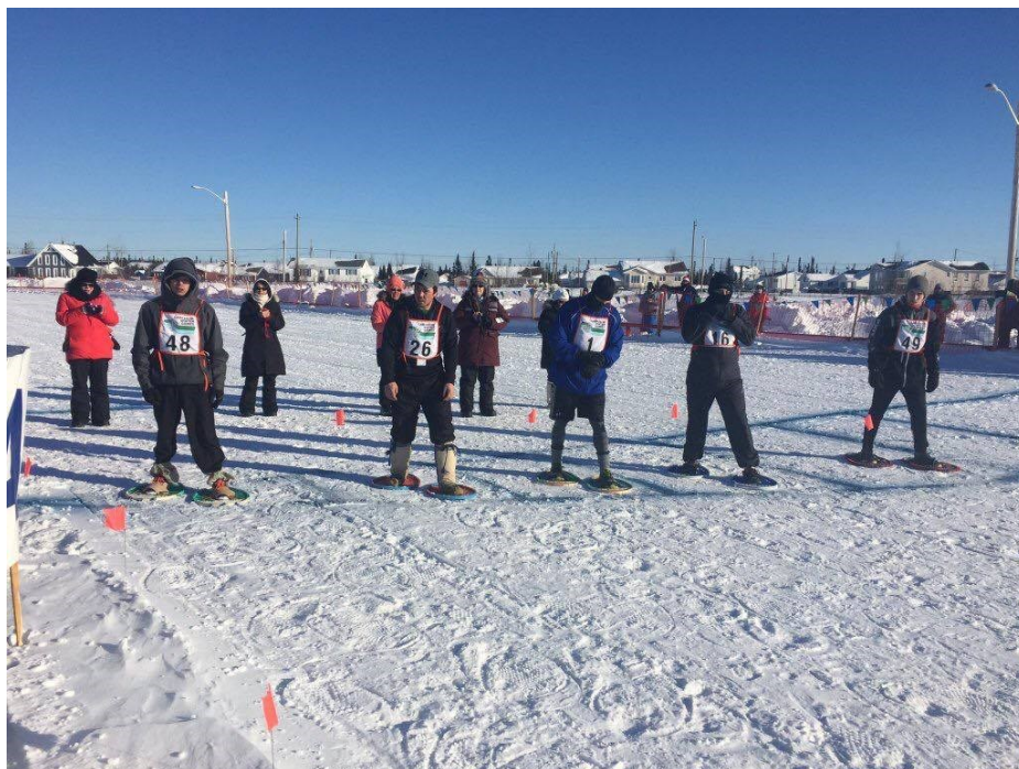
It was a large Labrador day for the snowshoe athletes yesterday, as they set out to make it to the finals taking place this morning.

The top six results for the men were as follows: