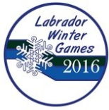
Table Tennis Community Points